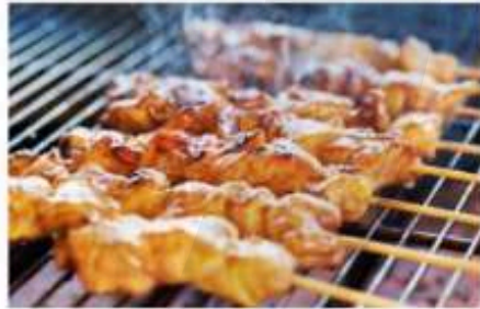
Yakitori (Chicken skewers)