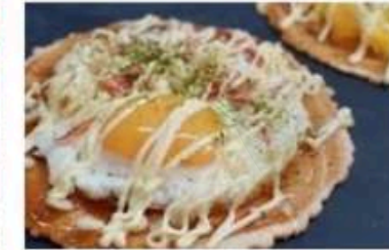
Rice cracker with egg