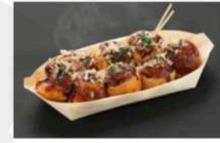
Takoyaki (Octopus balls)