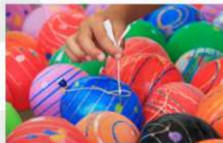
water balloon fishing