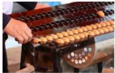
Baby Castella (Japanese sponge cake)