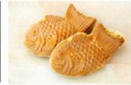
Taiyaki (Fish-shape pancake with bean paste filling)