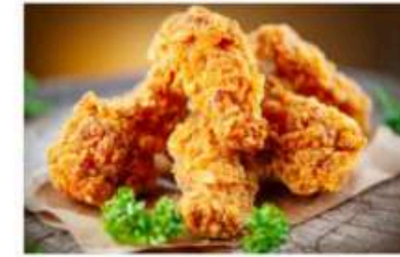
Karaage (Deep fried chicken)