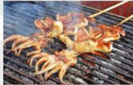
Ikayaki (Squid skewers)