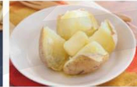
buttered baked potato