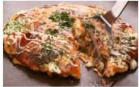
Okonomiyaki (savory pancake)