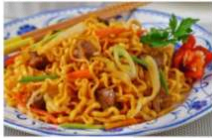
Yakisoba (Pan fired noodle)