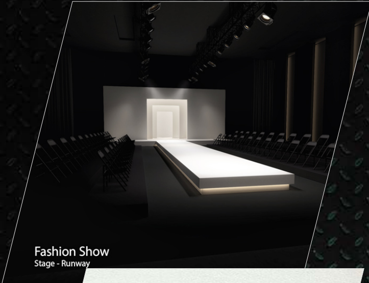
Fashion Show Stage - Runway