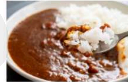
Japanese Curry (With rice)