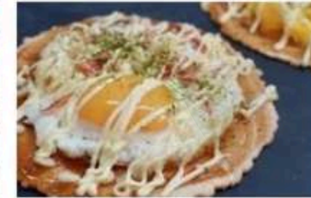
Rice cracker with egg